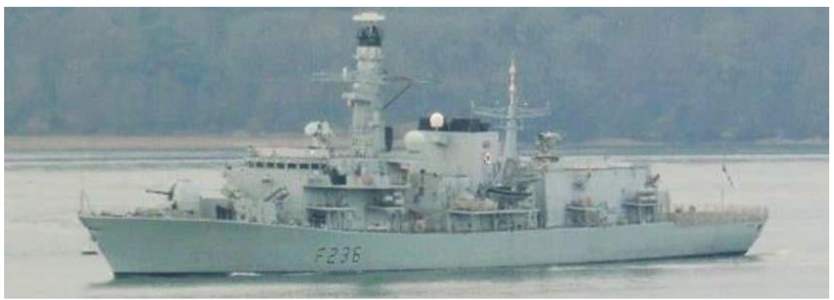
The Royal Navy is returning to operations after the Christmas break. First out of Devonport Jan 3 was the Type 23 Frigate F 236 HMS **Montrose*, going to sea after a period of maintenance.**

generators and gas turbines are slated to become operational for the first time by mid-2018. HMS Prince of Wales is scheduled to carry out its sea trials in 2019 with a total of 679 crew members. The aircraft carrier was officially named during a ceremony in Rosyth in September last year Its christening ceremony took place three weeks after HMS Queen Elizabeth first entered its home port of Portsmouth as part of its maiden sea trials programme The navy's Queen Elizabeth-class ships are being built by the Aircraft Carrier Alliance comprising BAE Systems, Babcock, Thales and the UK Ministry of Defence (MoD). Source: naval-technology